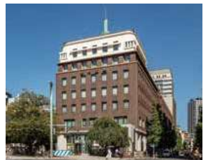
Nihonbashi Nomura Building: Nomura Securities, Headquarters 1930 / 1959 / 1981