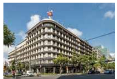
Osaka Gas building: Osaka Gas, Headquarters 1933 / 1966