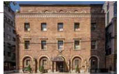
Osaka Club Building 1924