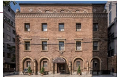
Osaka Club Building 1924