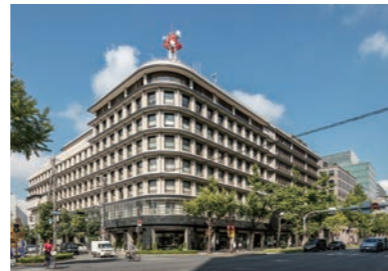
Osaka Gas building: Osaka Gas, Headquarters 1933 / 1966