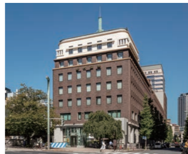
Nihonbashi Nomura Building: Nomura Securities, Headquarters 1930 / 1959 / 1981