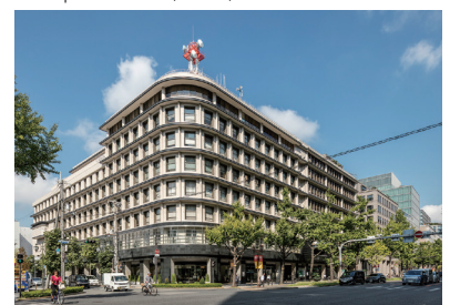
Osaka Gas building: Osaka Gas, Headquarters 1933 / 1966