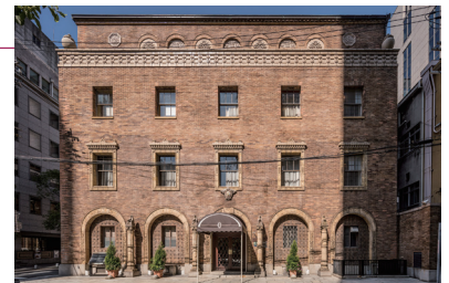
Osaka Club Building 1924