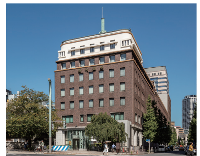
Nihonbashi Nomura Building: Nomura Securities, Headquarters 1930 / 1959 / 1981