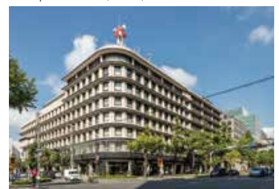
Osaka Gas building: Osaka Gas, Headquarters 1933 / 1966