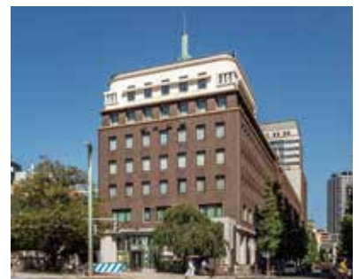
Nihonbashi Nomura Building: Nomura Securities, Headquarters 1930 / 1959 / 1981