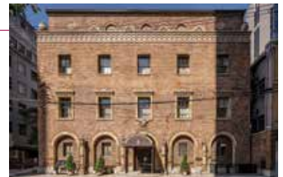
Osaka Club Building 1924